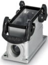
HEAVYCON box mounting base B16, with double locking latch, height 67 mm, with support 1xM25

Please be informed that the data shown in this PDF Document is generated from our Online Catalog. Please find the complete data in the user's documentation. Our General Terms of Use for Downloads are valid ( http://phoenixcontact.com/download )